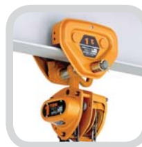
TSP plain trolley 500kg – 5T