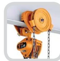
TSG geared trolley 500kg – 10T